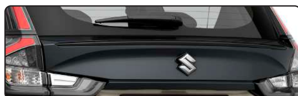
New Black Tail Gate Garnish