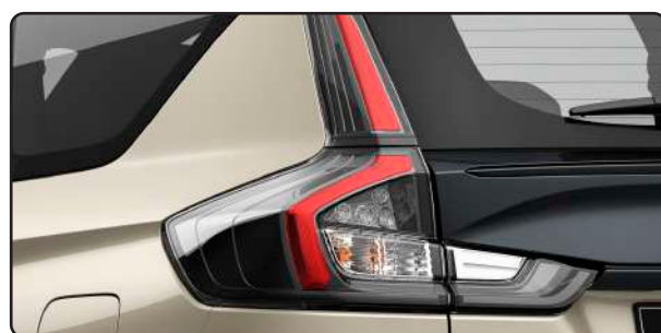
New Dark Rear Tail Lamps