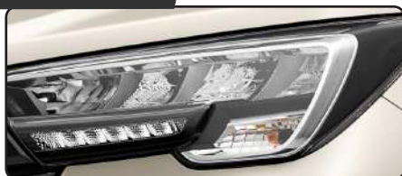
New Black Accented LED-DRL