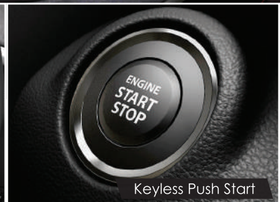
Keyless Push Start