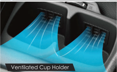
Ventilated Cup Holder