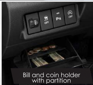
Bill and coin holder with partition