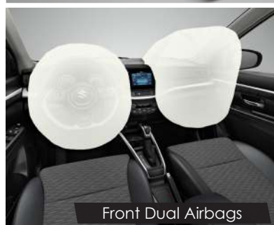
Front Dual Airbags