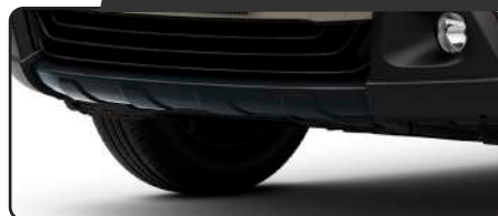
New Black Front Under Garnish