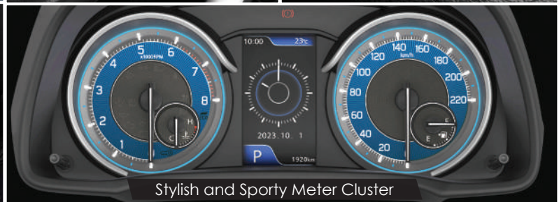
Stylish and Sporty Meter Cluster