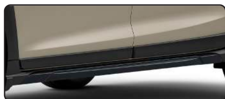
New Black Painted Side Under Garnish