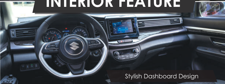
Stylish Dashboard Design