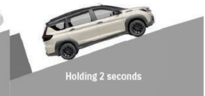
Holding 2 seconds