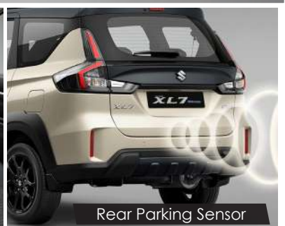
Rear Parking Sensor