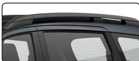
New Black Painted Roof Rails