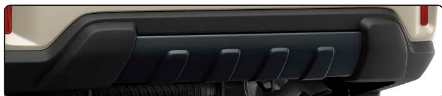
New Black Painted Rear Under Garnish